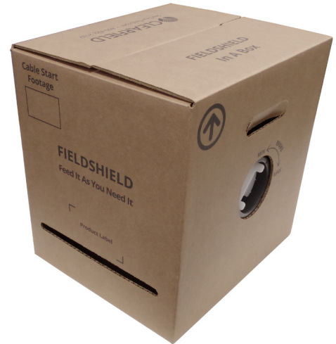
Available in 1, 2, 6, 12, 24 and 48 fiber counts

FieldShield Pushable Optical Fiber is a durable and crush resistant product that is suitable for most indoor or outdoor environments. Manufactured using PBT jacketing, pushable optical fiber offers flexibility as well as resistance to chemicals. FieldShield Pushable Optical Fiber is typically recommended to be used in conjunction with FieldShield Microduct.